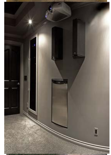
Projector, 7.1, gear and..... a fridge. Everything needed for an award winning Theater. Visit www.Monstercable.com

They are so comfortable that you won't want to get up after the movie ends! We have 5 examples in our new Grand Theater, so you can get a feel for the quality, and style...with Totem Drums installed too!