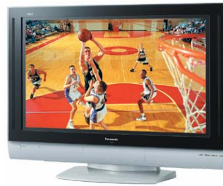
The Sleek New Panasonic Plasma

"...give the Panasonic the hands-down nod for best picture. There's nothing like those blacks."