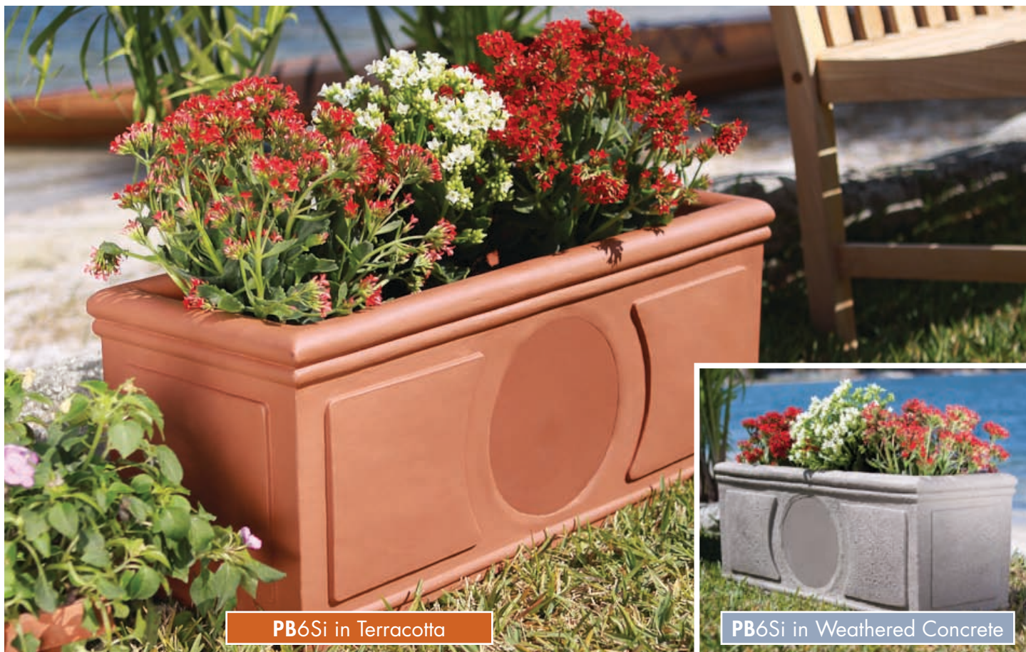
PB6Si in Terracotta